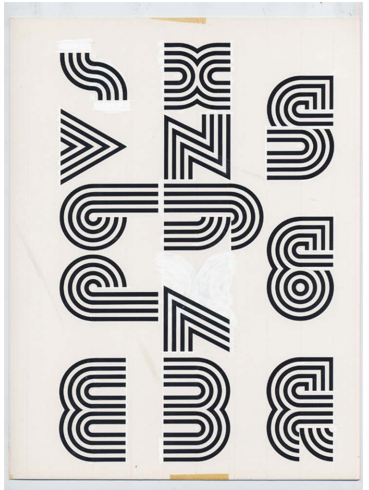
Original drawings by Roland Hirter, 1972.