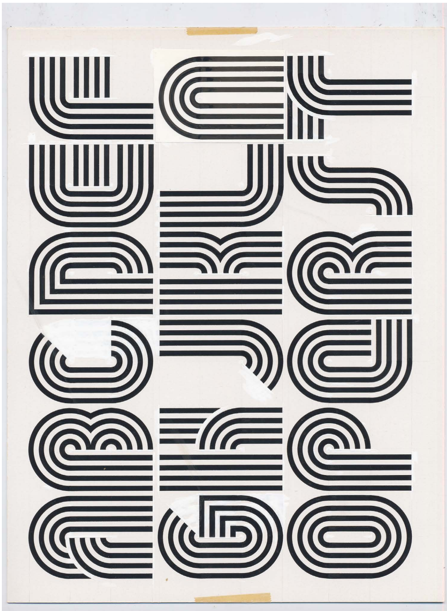
Original drawing by Roland Hirter, 1972.